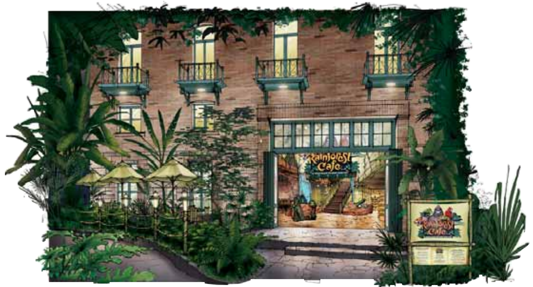
Exterior rendering of the Rainforest Café on the San Antonio Riverwalk. All Rainforest Café renderings provided by Cunningham Group Architecture, P.A., 2006