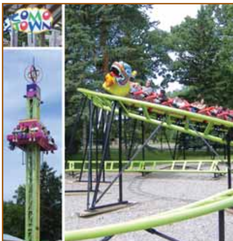
Como Town Amusement Park

Construction Communications annually publishes 35 regional Real Estate and Construction Reviews across the country. Each edition showcases a region's most important, innovative, and unique new construction and renovation projects. Only the companies referred for their work in helping to design, build, and supply the Minnesota region with the best projects are included in the publication. Hallberg was fortunate enough to have been involved with three of the top 50 new construction or renovation projects for our region.