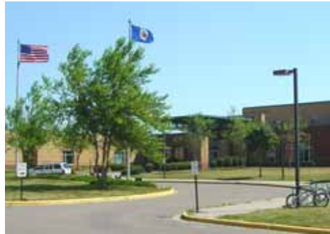
Hallberg recently performed recommissioning services at Skyview Community School in Oakdale.