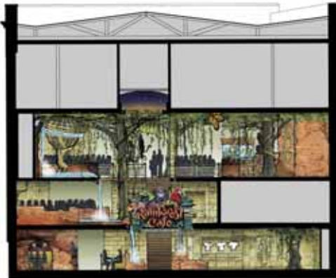
Rendering of the North-South section of the Rainforest Café on the San Antonio Riverwalk.

For more information on this project, or to find out more about our engineering services for retail and restaurant facilities, please contact Ken at 651.748.4345.